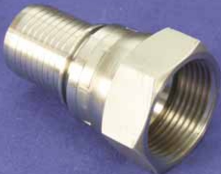
37° JIC Female Fittings (Type 02)