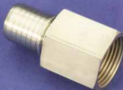
Fixed Female Fittings (Type 06 and 06/B) NPT, BSPT Threaded