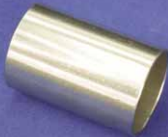
Crimp Ferrules - for all hose types