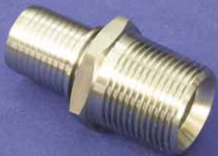
Fixed Male Fittings (Type 03 and 03/B) NPT, BSPT, BSPP, Metric Threaded