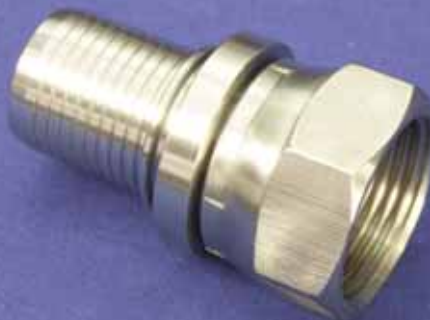
Female Union Fittings (Type 33) Cone Seat, Flat Seat, BSPP Threaded