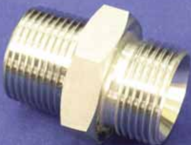
Threaded Adaptors Male/Male (Type 08 and 08/B) JIC/NPT, BSPP/BSPT etc.