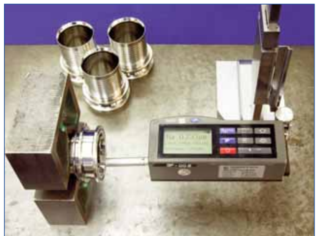
Surfscan, measuring internal surface finish

Now, Aflex are also able to supply customer specified end fitting designs to order, in a wide variety of sizes, materials and surface finishes.