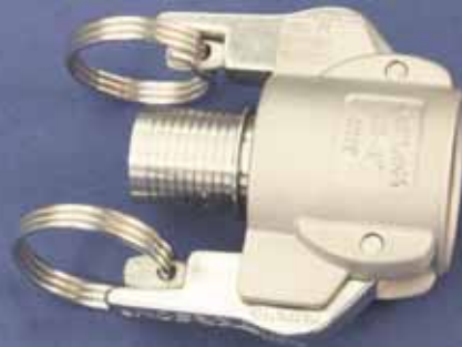
Swivel, Locking Arm Cam & Groove Female Fitting (Type 16 and 17)