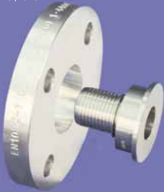
Swivel Flange Fittings (Type 12 and 12/PN) ASA150, PN16/40, JIS